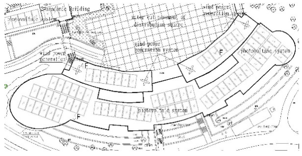
Figure 3. Photovoltaic and wind power system layout drawing (partial)

In this design, photovoltaic panels are laid on the roof of the flat roof of the teaching building, the administration building and the comprehensive building, and the laying area is 6150 \text{ m}^2 , the construction of photovoltaic microgrid, integrated into the campus power supply network. Small fans are installed at the wind crossings on the top floor of the building for 10 rack points to form a wind power microgrid, which is also integrated into the campus power supply network. The layout of photovoltaic and wind power (partial) is shown in Figure 3<sup>[9]</sup>.