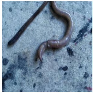
(c) the 3-5 adult