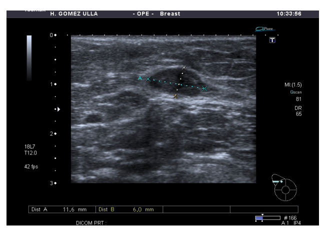
Figure 2. Ultrasound of the right breast showed a regular hypoechoic lesion

An ultrasound-guided breast biopsy is performed and in the pathological anatomy, proliferation of solid lobed pattern with fibrovascular tracts is described, consisting of rounded cells of granular broad cytoplasm PAS+ and round or oval nucleus with scarce anisonucleosis, compatible with GCT (It is likewise recognised as Abrikossoff's tumor).