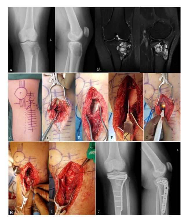
Figure 1. This demonstrates a case done under extended curettage. Preoperative radiographs (A) and MRI (B) reveal a Campanacci II GCTB of the proximal tibia and patient underwent surgery. Surgical markings (C) were done to map the landmarks, area of the lesion, and the planned incision. Curettage (D) was performed revealing grayish, friable tissue. Extended curettage followed using ethanol

Campanacci grade, as well as soft tissue infiltration, and larger size of the lesion does not significantly impact the recurrence of GCTB<sup>[15]</sup>.