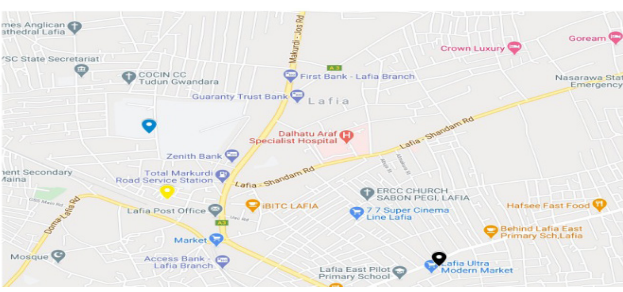
Figure 1. Map of Sample Locations