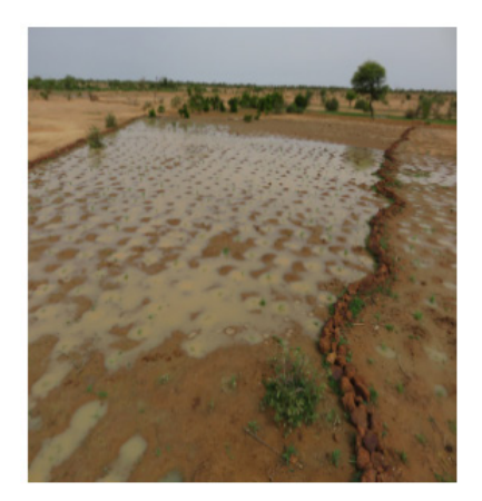
Figure 8. Half-moon after a rain in a field in Burkina Source: Livelihoods, 2017.