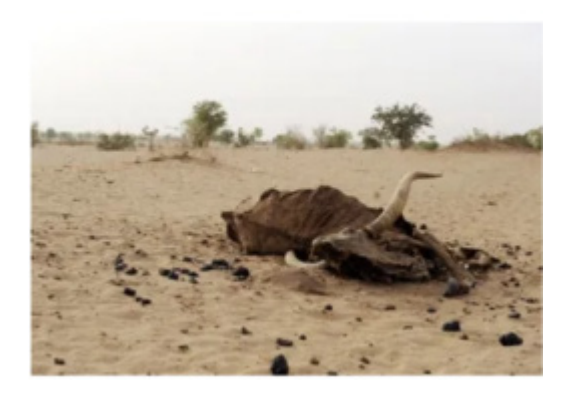
Figure 5. A cattle carcass in northern Niger in May 2010. Drought-related famine episodes are recurrent in the country

As climate change is having considerable impacts on the local climate, increasing desertification, land degradation, and disrupting the endemism and adaptive capacities of species, ecosystems supported by human activities, are also having an important role in climate disruption. Deforestation, reduction of fallow land, population growth and urbanization combine to reduce the water absorption capacity of the soil. If no measures are taken to maintain