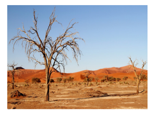
Figure 2: Drought in the Sahel, Mediaterre (2020)

aged, putting future production at risk. Many granaries were also destroyed by the rains and flooding <sup>[31]</sup>. The same year, 49 cases of flooding were registered in Mali, with about 46,952 people affected, compared to 41,008 in the previous year and nine deaths compared to 24 in 2019 <sup>[32]</sup>. In Burkina Faso, 41 people died, 112 injured and 12,378 left homeless in the 13 regions affected <sup>[33]</sup>. Changes in temperature, rainfall, and the occurrence of floods, droughts and lightning all have also negative effects on forage production, plant species, water availability, animal health and livestock productivity (Figures 5, 6 and 7) <sup>[16]</sup>.