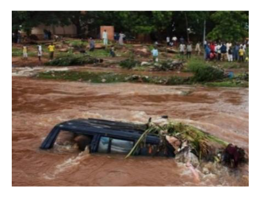
Figure 4. Bamako floods: Thousands were also made homeless as the Niger river burst its banks, destroying around a hundred houses, Denise Hammick, 2013.