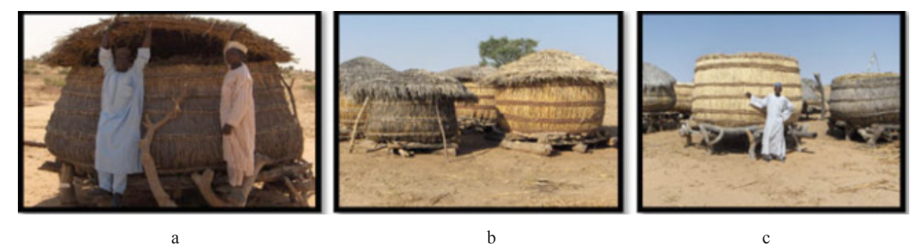
Figure 11. The Rhumbu Granary in Northern Nigeria