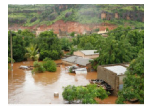
Figure 3. Bamako area under water after an episode of torrential rains during which more than 20 people lost their lives/AFP/Archives/Habibou Kouyate.