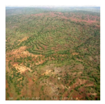
Figure 10. Plantation of native acacia trees along Adger-Doutchi Plateau in Niger