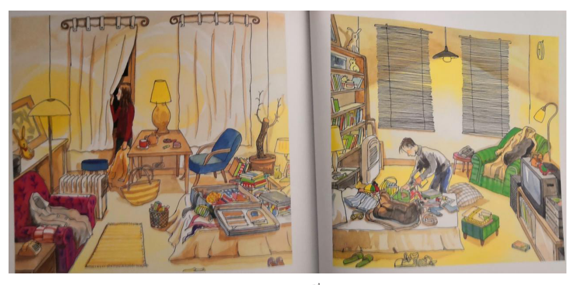
Figure 6. The date is 22<sup>nd</sup> of December

Even though the yellow colour metaphor may give the reader positive emotions, but as brown colour per-