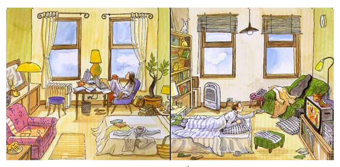
Figure 1. The date is 6<sup>th</sup> of October

Form the pictures (see Figure 1) it can be seen the artist Jimmy choose bright light yellow as dimensional mass tone in both rooms, the walls, floors, cabinet, bookshelf, curtains, shutters all covered with the bright yellow. The white poufy could in a pale blue sky outside the window, the woman sitting in the dark blue armchair drinking coffee with a bright red cup on the left page, while on the right page the man wearing a pair of bright green socks lying on his stomach in bed, watching TV. The bright and