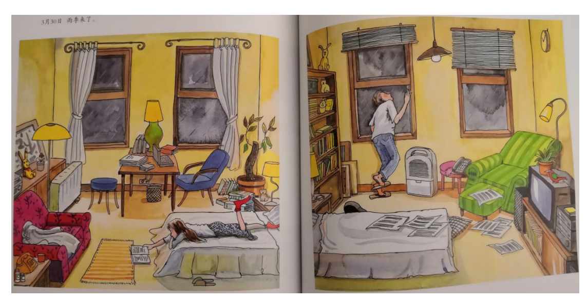
Figure 3. The date in 30<sup>th</sup> of March