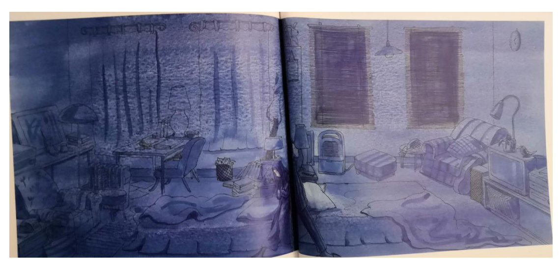
Figure 5. The date is 6<sup>th</sup> of December

a rough sketch of the furnishings. The only bright colour in both rooms are the faces of both characters. The woman and man all wear light pale pink in their face, and they all closing eyes standing against the wall. In fact, they have no idea that they share the same wall all the time. For the wall is drawing in deep dark blue in the middle of the two pages, it often neglected by readers, so it seems that the two characters stand back to back. All pictures were splashed with patches of blue can be perceived as metaphor of sad, tired and heart broken. For they have not seen each other for almost one year, there is no bright colour in the picture may suggest that there is no hope inside the heart of the characters.