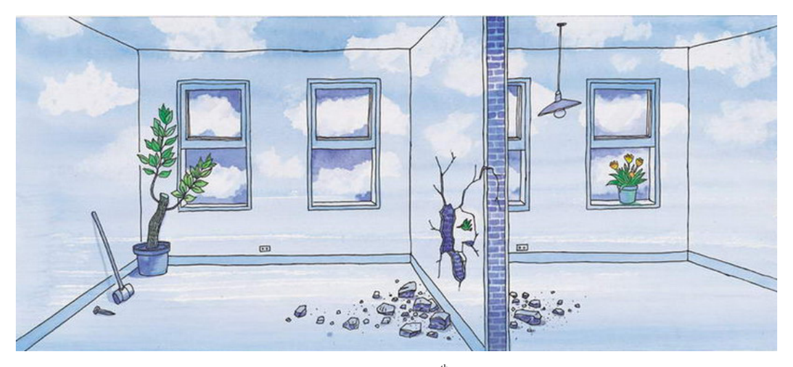
Figure 7. The date is 6^{th} of March

The advantage of Lankoff's Conceptual Metaphor Theory [9] and Forceville's Multimodal analytical method lies not only in adding one more way of seeing colour-emotion associations [2]; it rather a new method to evaluate the types of emotion that colour metaphors could conveyed in picture books. One example is Jimmy Liao's picture book-Turn Left, Turn Right [11] use the bright warm colour such as yellow, light blue, white, orange, pink to express positive feelings (like joy, love, relief, admiration, pleasure and contentment), while he also use the dark cook colour (like black, gray, brown, deep dark blue) to show the sad, disappoint, fear, regret feelings of the characters. This drawing method might be handy for either those who paint picture books or who prefer to use colour to describe