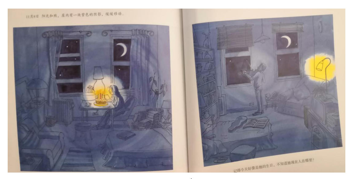
Figure 4. The date is 8<sup>th</sup> of November

dark blue shadow on each stuff in both of the rooms. Outside the window there are more darker blue, even tend into black to indicate the time of deep night. Those blue and black colour which link with people's emotion of sadness and fear, act as the metaphor here to show the man and woman feel very upset. They have not seen each other for about eight months, and still cannot forget each other.